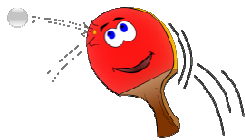
Table Tennis Report