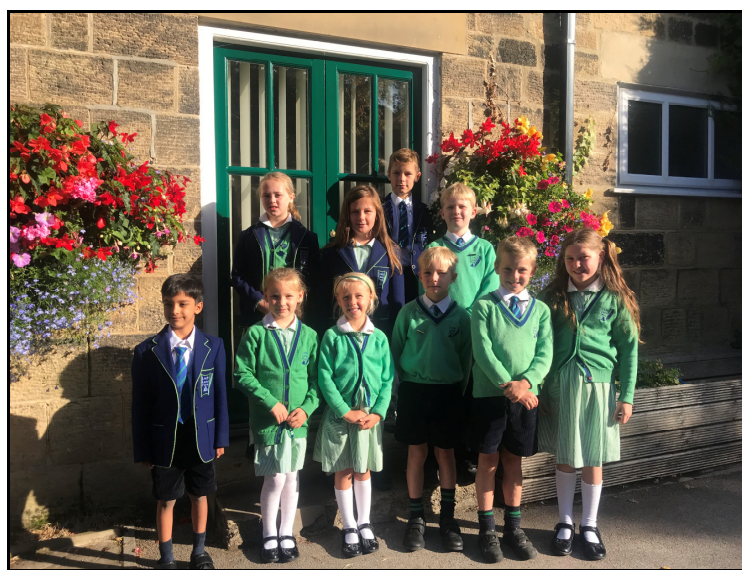
School Council representatives 2019-20

Congratulations to the new representatives on our School Council. They have all been elected by their fellow classmates and were announced in our Friday assembly this morning. Good luck to them all in their new roles.