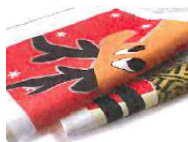
TEA TOWELS From - £9