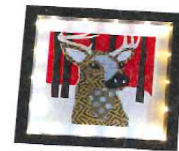
LIGHT UP FRAMES From - £20