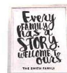
PERSONALISED PRINTS From - £18