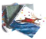
NOTEBOOKS From - £7