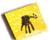
ART CANVAS From - £35