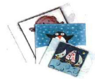
CHOPPING BOARDS From - £15