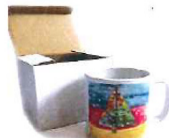
DANDY MUGS From - £10