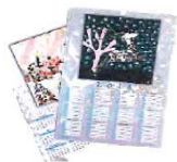
POSTER CALENDARS From - £5