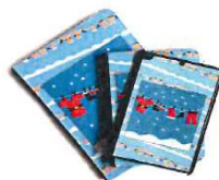
IPAD COVERS From - £15