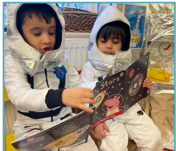
Form 1 have been enjoying their new Space Station in their classroom