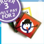
BACKS OF CARDS