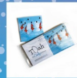
GIFT TAG SET