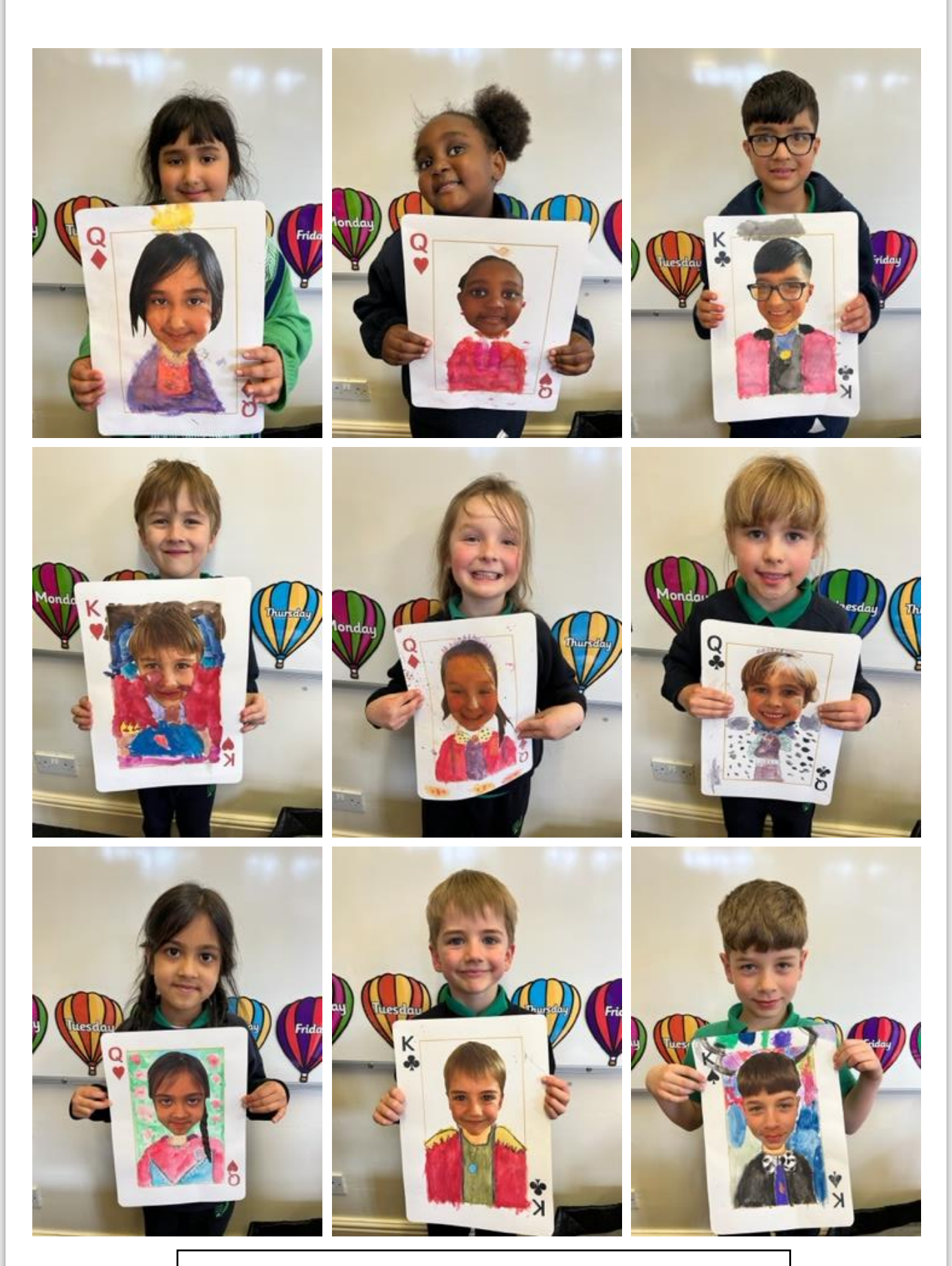
Form 3 Kings & Queens