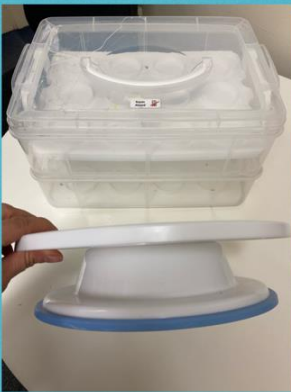
Unclaimed items from the Bun Sale held last Thursday. Thank you so much for your bun donations. Please collect from School Office.

New to You Uniform Sale Friday 8 th April 3.00-5.00pm The Gym