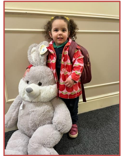
The Friends' Spring Fair