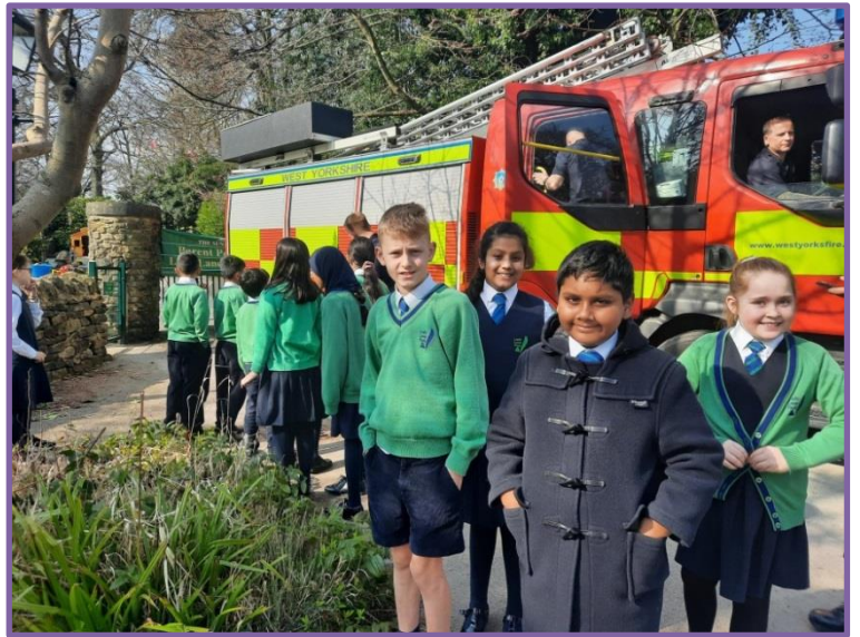
West Yorkshire Fire Service visit to LVI & Kindergarten