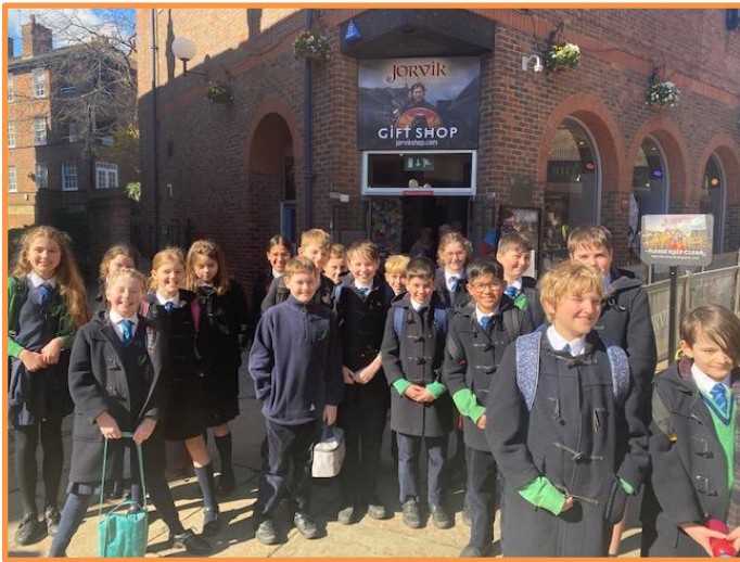
UVI Trip to York