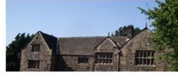
Ilkley Manor House Trust Charity Number 1174051