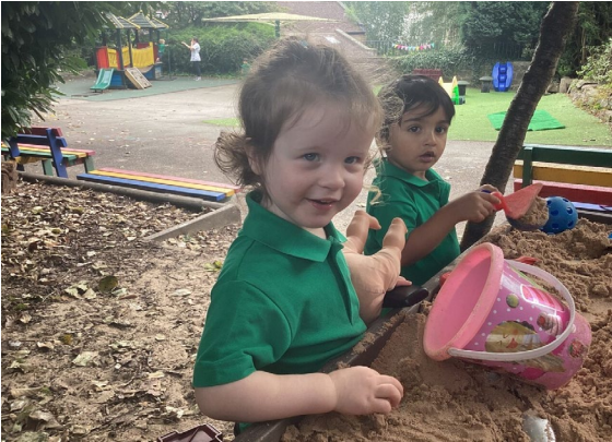
Nursery - exploring outdoor provision