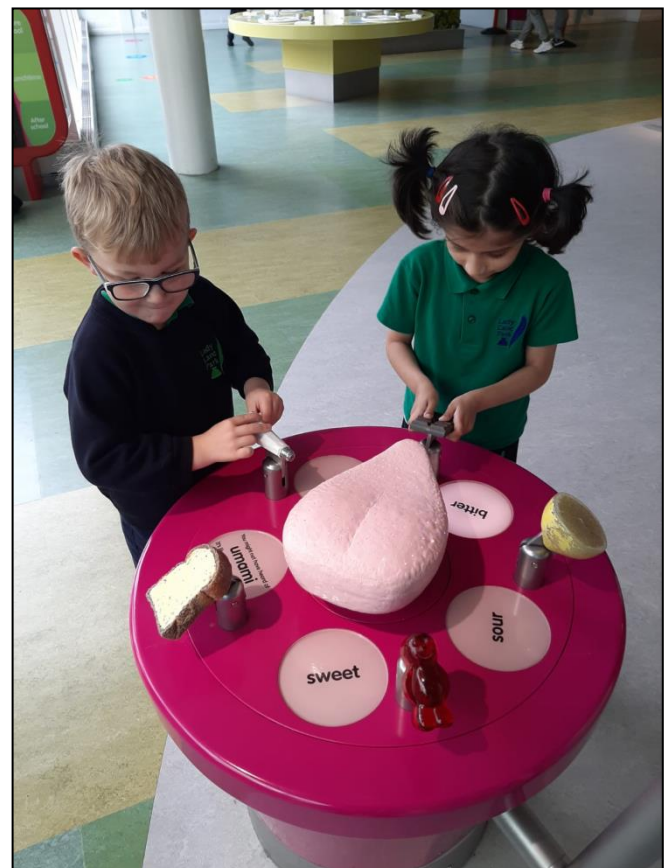
Form 2 had a great day out at Eureka learning all about the human body.