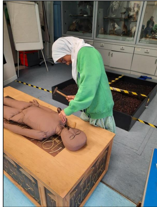
L6 had a great time at Cliffe Castle learning about mummification.