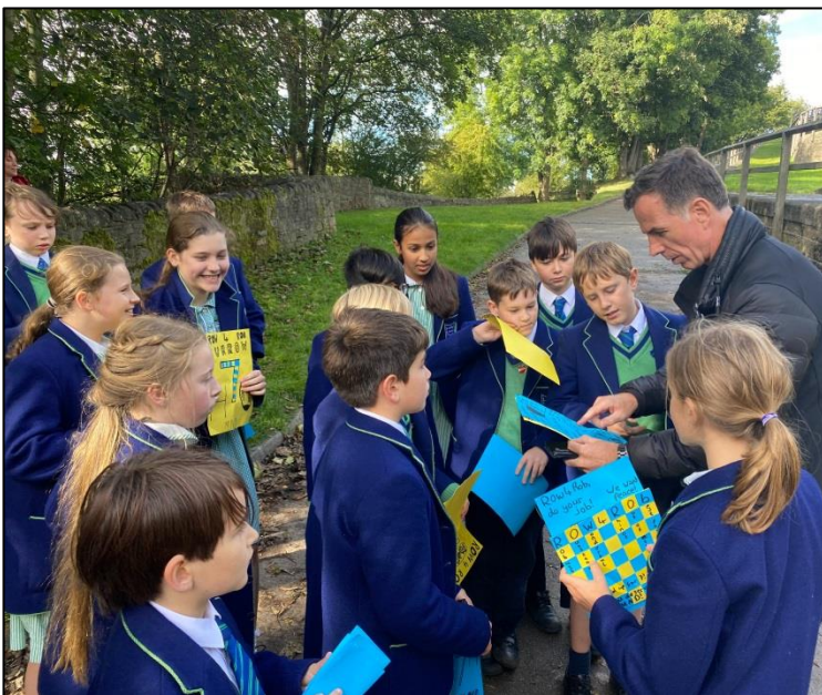
U6 met Rugby League legends Phil Clarke and Brian Noble at the Five Rise Locks.