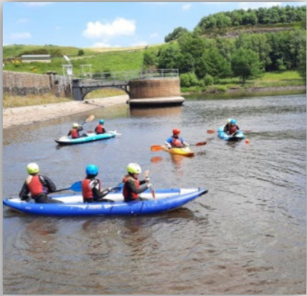
UVI Outdoor Pursuits Day at Doe Park