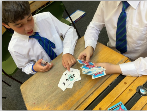
Junior Games Morning