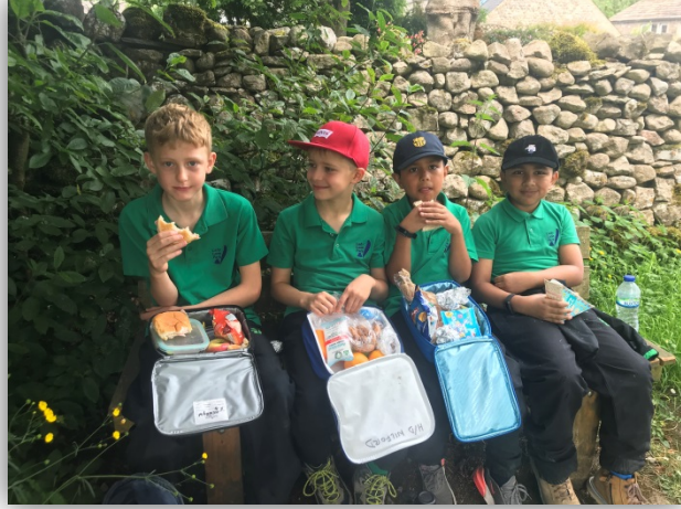
Form 5 had a great day out in Malham!