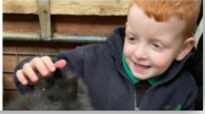
Kindergarten's Visit to Thornton Hall Park