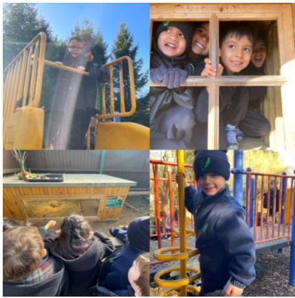
Form 1 had a trip to Ponderosa Zoo