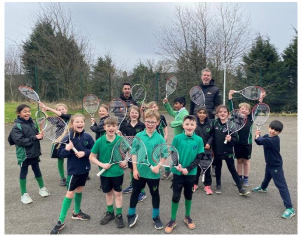
All our pupils enjoyed a Tennis Taster session with 'Thrive Tennis Coaching' this week