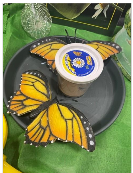
Form 1 (Reception) were extremely excited with their delivery of live Caterpillars from Insect Lore last week. We can't wait to see them turn into Butterflies.