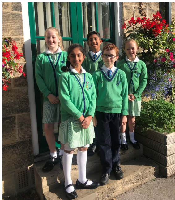
Good luck to our new Heads of School for 2019-20

We have had our first full week of term and the children are well settled and in full swing!